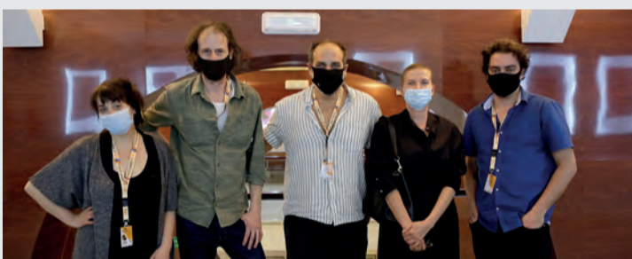
El equipo de la película El empleado y el patrón .