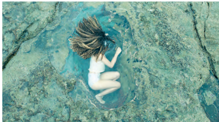
Octopus Skin / La piel pulpo.