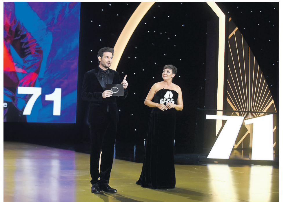
Gorka Otxoa y Eva Hache, presentadores de la gala.