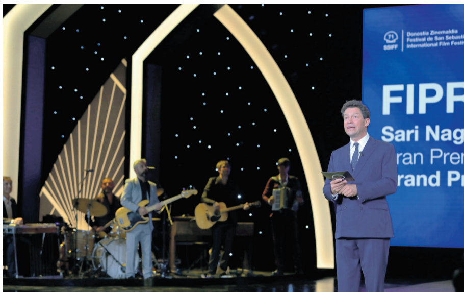
Dominic West aktore ingelesa Audience musika taldea atzean duela.